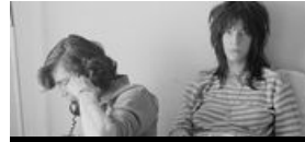
Sex and art and rock' n' roll Musician Patti Smith promised her