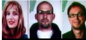
Why Irish passports are a spook's best friend The use of Irish passports in the