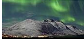
Tripping the light fantastic Tromsø in the Norwegian High