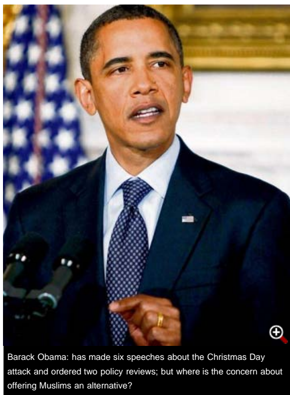
Barack Obama: has made six speeches about the Christmas Day attack and ordered two policy reviews; but where is the concern about offering Muslims an alternative?

Christmas Day bombing of Northwest Airlines flight 253. Amid the flurry of recriminations and speeches, it was reported that a state department official "misspelled" the name of Umar Farouk Abdulmutallab, the Nigerian who attempted to bring down the aircraft with explosives sewn into his underwear, thus preventing data concerning him and al-Qaeda in the Arabian Peninsula from being correlated.