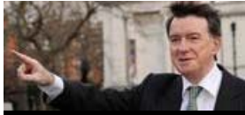
One day with Lord Mandelson Twice ejected from Cabinet, we talk