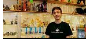
Head shops feel the heat The recent fires at two Dublin head shops highlight the conflict at the