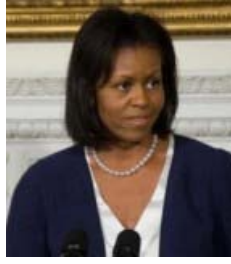
Laura Ingraham Guest Host Tammy Bruce Calls Michelle Obama 'Trash' (Audio)