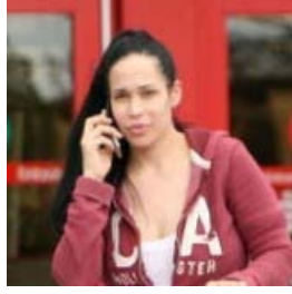
Octomom Fires Four Free Nurses After Child Protective Services Call