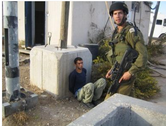
It is illegal to transport Palestinians into Israel without a permit.