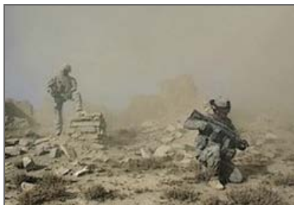
US soldiers stand guard in eastern Afghanistan. [file]

Obama's vision for change, however, is constrained by the severe global and US recessions and the domestic and international financial crisis that has brought down several major US and international banks. The higher than expected unemployment rate in the US and the failure of several stimulus packages to shake the US economy from its torpor have forced the new president to focus more on the domestic scene than on foreign affairs.