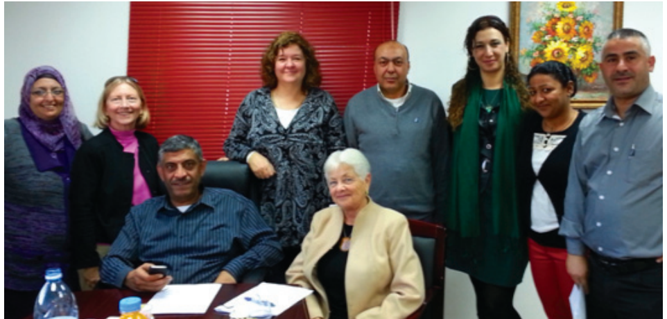
CRT and Women Reborn team with Mayor of Jisser Al Zarka and staff.

During 2012, CRT activities began to demonstrate some results that could not have been anticipated. On a recent trip to Israel, we had the opportunity to meet with the mayors of the three Arab villages in which the Women Reborn program is now operating – Fureidis, Jisser Al Zarka, and Ein Al Sahla. We were heartened to find that in all three villages, Women Reborn is now thoroughly interwoven with municipal plans for social and economic development. Even more surprising, all three mayors expressed enthusiastic support for the political empowerment of the women of their village, even searching for a woman candidate to run as their “second” in the 2013 election. This is an example of how a successful grassroots project can create and nurture relationships among local political and cultural figures in such a way that critical social norms are radically changed.